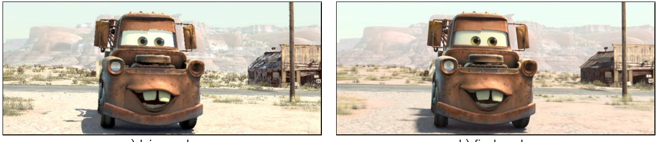
a) lpics render