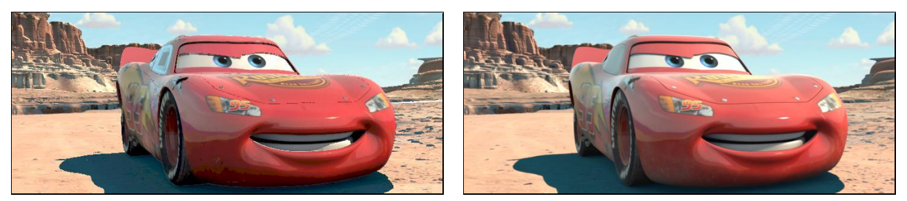
Lpics render \approx 0.1 s